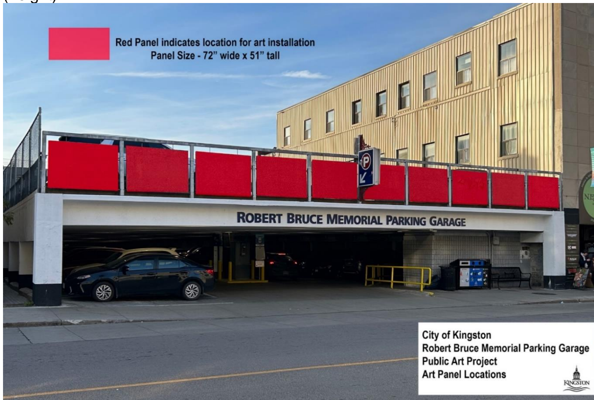
Above: Image depicting art locations for the Robert Bruce Memorial Parking Garage Public Art Project The 'P' sign pictured will be removed prior to art installation.

The artwork will utilize 10 flat concrete units on the front exterior and on the second level of the parking garage. The artwork will be produced on di-bond panels which will be installed across the 10 existing panels using a custom framing structure. The City of Kingston will coordinate the printing and installation of the final works. Each concrete panel measures 72 inches/182.88 centimeters (width) by 51 inches/ 129.54 centimeters (height)